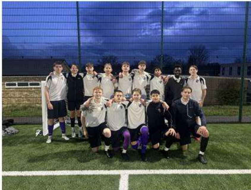
FT - Hoo 1 - 6 Howard