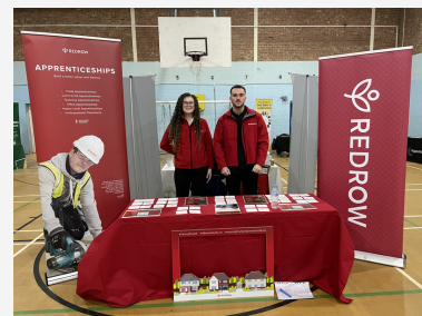
Careers Fayre 2023

19th January – Year 11 Mock Interview Event 26th January – Howard School 6th Form applications deadline 31st January – Selected Year 9 University Visit 5th–9th February – National Apprenticeship Week 7th February – Careers Fayre (Selected year groups) 14th March – Year 12 University Visit