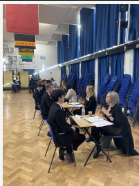
Yr11 Mock Interviews 2023

Year 10 Work Experience 10th – 14th June