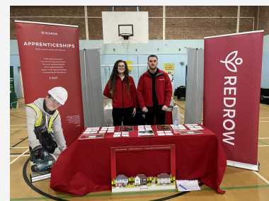
Careers Fayre 2023

26th April – Year 12 University Campus Visit 28th April – Year 12 own WEX placement cut off date 1st May – Year 10 provided WEX cut off date 26th May – Year 12 provided WEX cut off date