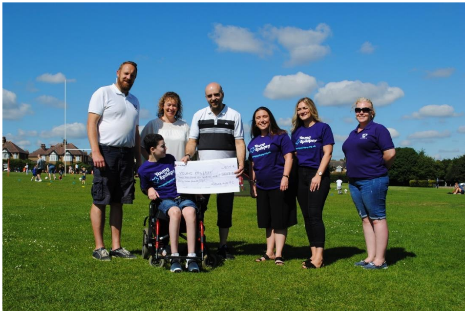
Cheque presentation to Young Epilepsy.

Looking back over the past year, the tail end of our season is the annual Charity shield, which was in aid of Young Epilepsy. The charity for the event has a special importance to our club, as one of our coach's son suffers with this condition. As usual, the club put on a great event holding a ladies' match and the Coaches vs Parents match, where, once again, the parents were victorious for the 5 th consecutive year. I'm confident the coaches will win one year! However, more importantly was the support shown by all, as we managed to raise £3,663, taking our 5-year total donated to charities to over £20k!