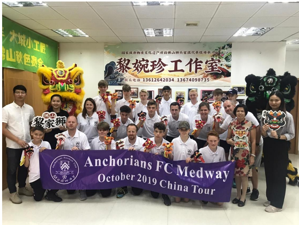
The team in a dragon making class at a local school.

October half-term saw fourteen U15 boys make the trip to Foshan, China, to take part in the now annual friendly football exchange. Once again, they were treated like royalty, with everything laid on for the team, including experiencing the local culture. The team visited several local schools, with 100s of pupils overwhelming the boys at one school, wanting to take photos and speak to the players; it was like something one might see if One Direction were coming to town! The team had 3 tough games on the trip and thoroughly enjoyed them all, creating new friends along the way, in a once in a lifetime experience.