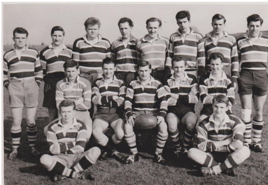
Old Anchorians 1 st XV

25 March 1961 (v Hastings & Bexhill RFC, won 49-3)