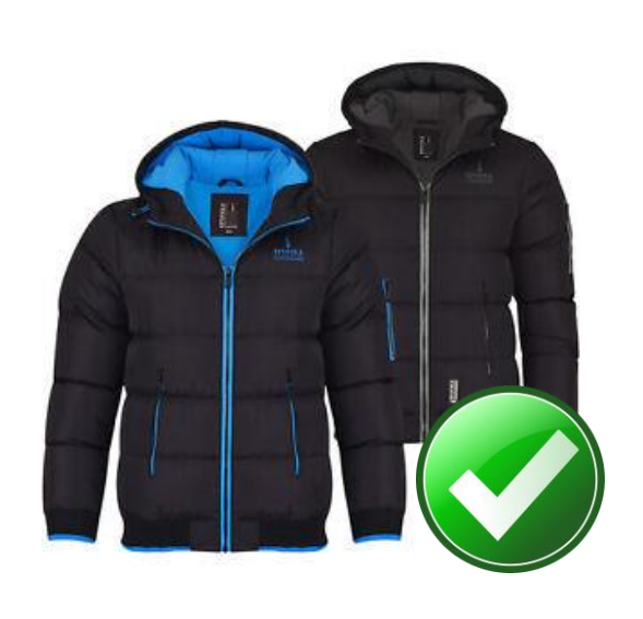
Predominantly one dark colour

It is important that students have a suitable coat that keeps them warm and dry and can withstand the extremes of weather in the winter months.