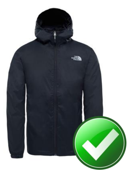
Small discrete logo