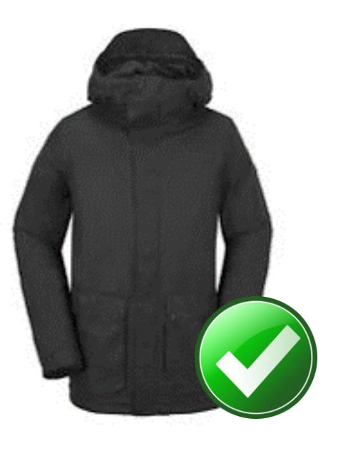
Suitable Outdoor Coat