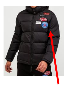
Features such as multiple badges or large logos