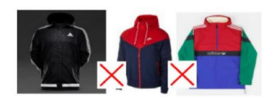
Branded sports jacket/ training top / bright or multi coloured